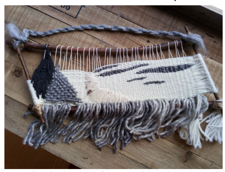
Your finished piece of work will look like the wall hanging in the photograph above.